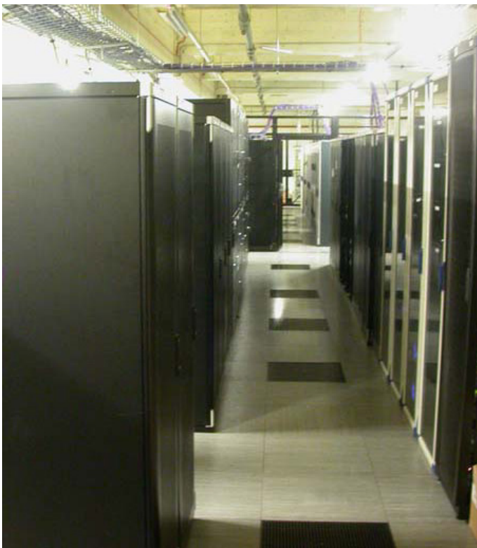
Cold aisle with the overhead cables & fire sprinkler system