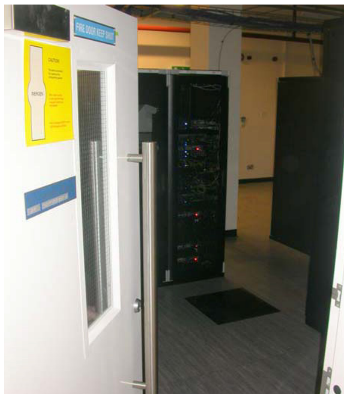
Security / fire door leads into new facility

for games like Unreal Tournament allowing online gaming. Like nearly all data services people expect the product 24/7. This creates its own challenges. Security approval, access and time on site are all key issues, if you can limit the number of engineers and the hours they work you suddenly save yourself a real headache. Copper and fibre preterm cabling are definitely a sensible solution reducing the man hours on site and guaranteeing quality terminations.”